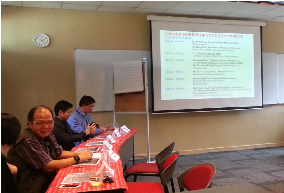
Photo: Workshop Panel