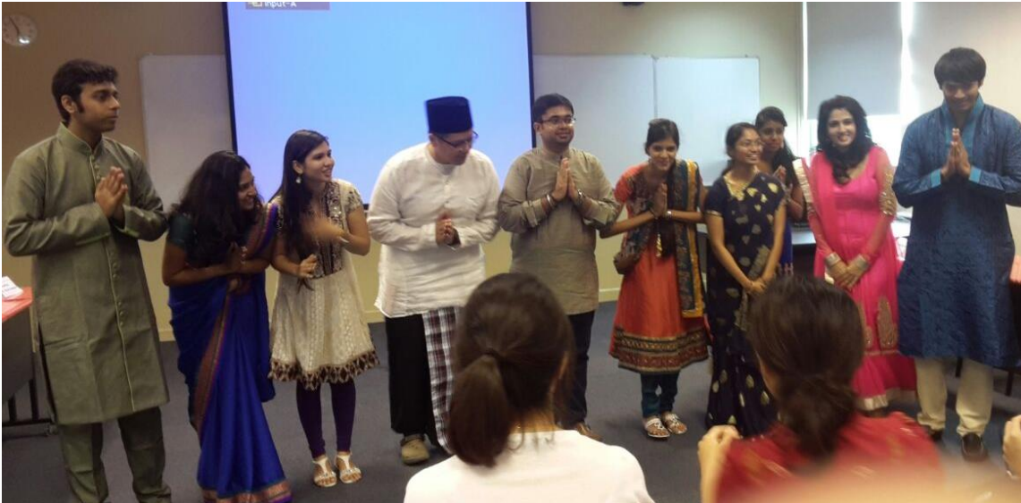
Photo: UON Singapore students in their traditional costumes